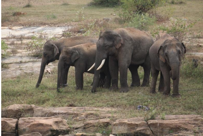
Figure 2: A wild adult male elephant 'Sidda' interacting with 3 captive females (AF, SAF and JF) that are chained.

The researchers were witness to a two-hour long interaction of an adult male elephant with a female adult, a sub-adult female and a juvenile female elephant. Considering that bulls do not select their group partners randomly, and musth wasn't a driver to this interaction either, it appeared that the bull was largely