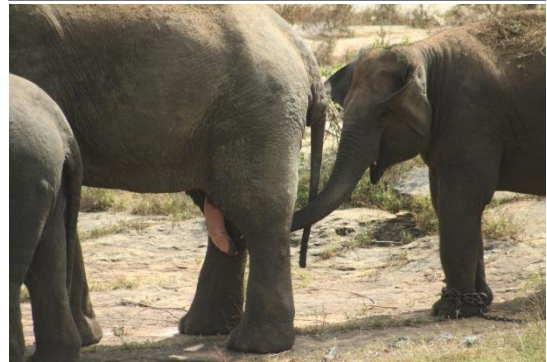
Figure 5: A captive juvenile female inspecting the raised male organ of the wild bull.

Captive elephants effectively use only a small patch of forest land to forage, which is most probably a result of their restricted movement (they are generally chained or hobbled). But this could also be the influence of lone bulls nudging their movements. So, one would expect elephant in semi-natural