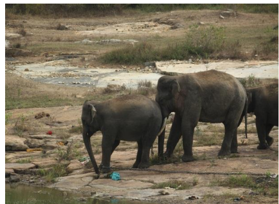
Figure 4: The wild male nudging a captive sub adult female.

When captive elephants are released into the wild, females tend to serve as conflict hotspots by attracting the lone bulls in the vicinity. The bulls use this as a refuge and a prologue to raid crops lands in the vicinity. This interaction would lead to the assumption that the male elephant, over a period of time, would use the captive female temporarily to raid nearby crop lands — such behaviour is extremely unnatural. The assumption could be that majority of bulls in Bannerghatta do not rely on